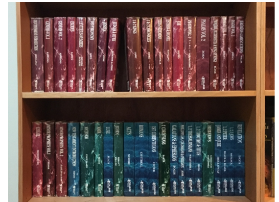
College Press Commentaries