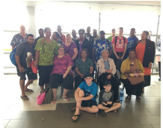
Samoa Campaign Group

One thing that has come up recently with the school is the need to complete the process of Registration with the FHEC (Fiji Higher Education Commission). We have already gained legal Recognition . Registration is the next step, and it is good for five years. Mainly, it involves a considerable amount of additional paperwork! However, the process is moving along smoothly. We are hopeful that the process will be completed by the time we return to the U.S. for our reporting trip. Please pray that there are no hurdles which will interfere with this process!